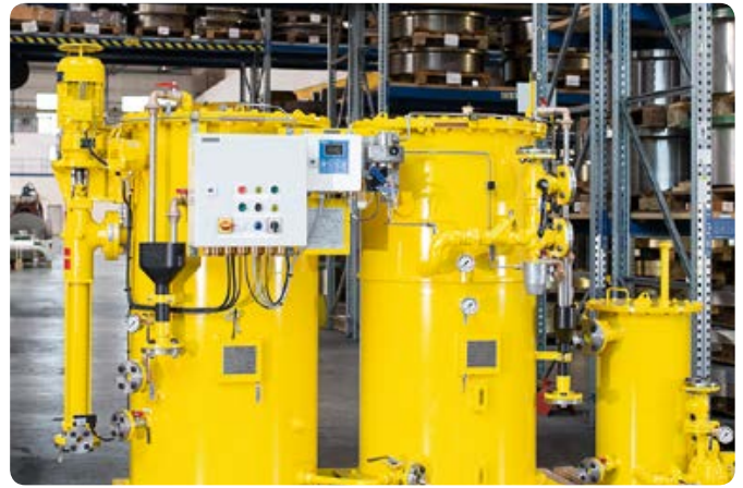
Booster pump design