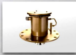
Cargo Tank Radar Gauge