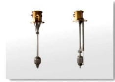
Bunker Level Gauge